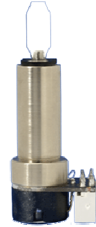
Shown With Mini-CT Connector

Coil Resistance: 3.7 Ohms, +/-10% Coil Inductance: 109 μH, +/-10% Back EMF Voltage: 48.7 μV/(deg/sec) RMS Current: 2.4 A at Tcase of 50°C, Max Peak Current: 8 A, Max Small Angle Step Response: 100μs